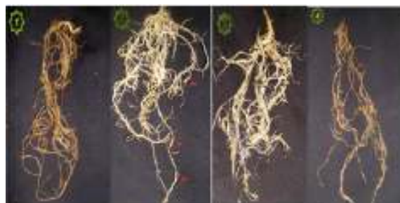
Figure 2. Effect of certain concentration of irrigated magnetic water on Meloidogyne incognita infecting cowpea plant cv. (1=Tap water, 2=10 ml.t, 3=20 ml.t, 4=40ml.t)

** Root gall index (RGI) or egg-masses index (EI) was determined according to the scale given by Taylor & Sasser (1978) as follows : 0= no galls or eggmasses, 1= 1-2 galls or eggmasses , 2= 3-10 galls or eggmasses, 3= 11-30 galls or eggmasses, 4= 31-100 galls or eggmasses and 5= more than 100 galls or eggmasses.