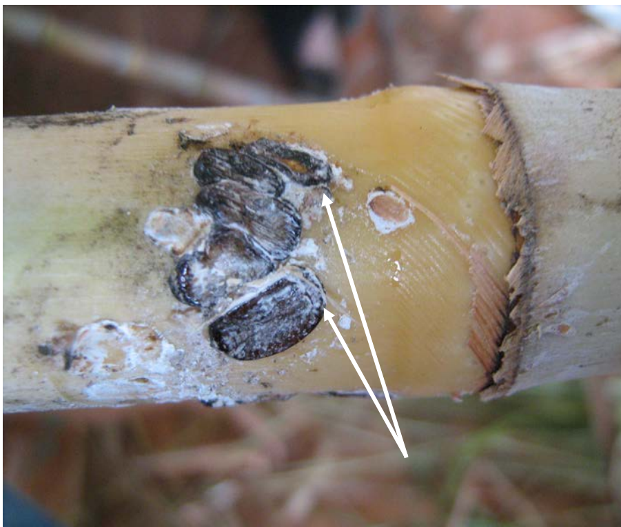
Fig (2):-The stalk soft scale Aclerda takashii Kuwane on sugarcane stalk.

results agreed with (Maareg et.al. , 1992) who found that sugarcane were attacked by four species of scale insects belonged to three families. There were significant differences among varieties during two seasons. Potassium level K48 Kg /fed was more effective on population of stalk soft scale where the population reduced than the other population which applied by different potassium levels in the two successive seasons. The two levels K24 and K72 kg / fedan were differed in their effect on population density of stalk soft scale.