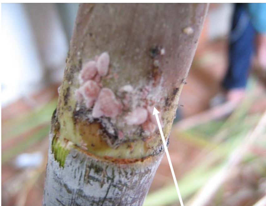
Fig (1):- Mealy bug Pseudococcus sacchari CKII on stalk of sugarcane.

could be arranged in the following descending order according to number of mealy bug which were affected by potassium fertilizer levels as follows: K48 (15.00 , 32.00 , 4.33 and 9.33 insects /stalk ) , K72gk /fadden (65.00, 42.00, 0.33 and 4.33 insects /stalk ) , K24 Kg/fedan (92.67, 49.33 , 49.00 and 51.00 insects /stalk ). In regard to sugarcane varieties, Table (5) revealed that all tested sugarcane varieties were infested by mealy bug which treated by potassium levels and were susceptible to these insects. There were significant differences among treatments and varieties in both seasons. The high susceptible sugarcane variety was Co413, while GT54-9 variety was tolerant. This results are in obtained by Abou-DooH, et al. , (1999) who reported that GT54-9 was middle susceptible to infested by mealy bug .